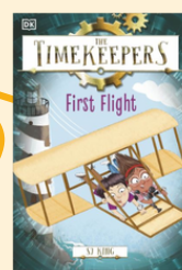
The Timekeepers: First Flight by S J King