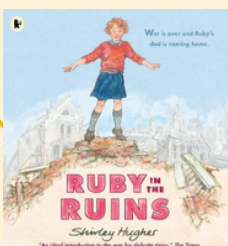
Ruby in the Ruins by Shirley Hughes