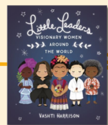
Little Leaders: Visionary Women Around The World by Vashti Harrison